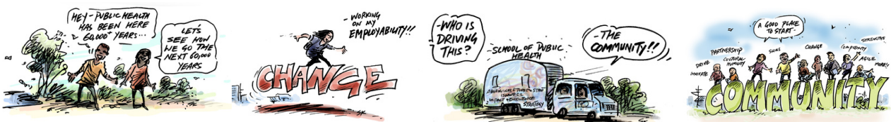
Illustrations by Simon Kneebone

By developing their political agency to shape policies that support an equitable & viable planetary future