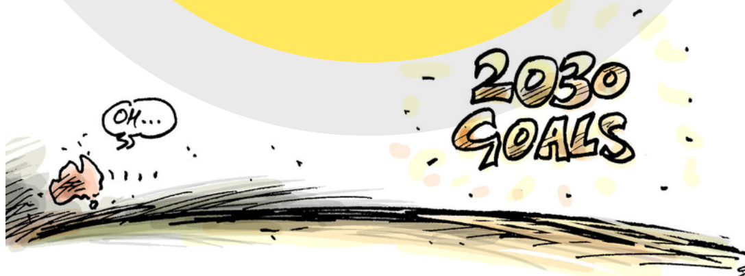
Illustrations by Simon Kneebone

For Australasia public health educators to work as a community of practice to co-create public health curricula that prepares a bold and adaptive workforce to lead public health action for a more sustainable and equitable future.